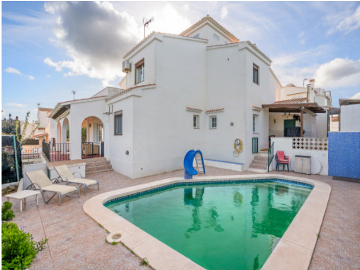
Pool area and sun terrace