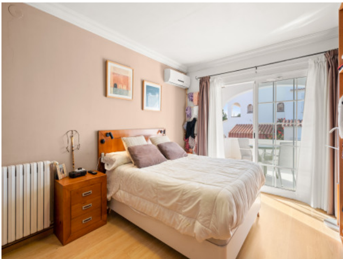
Further bright double bedroom