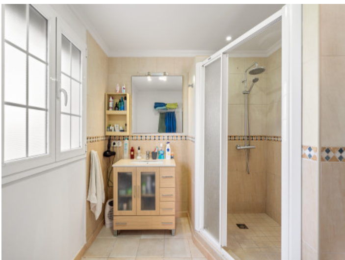
Spacious shower bathroom