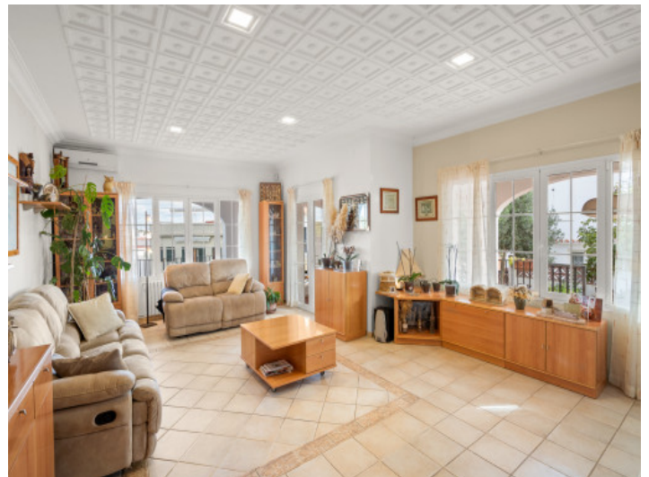
Large, lightflooded living area