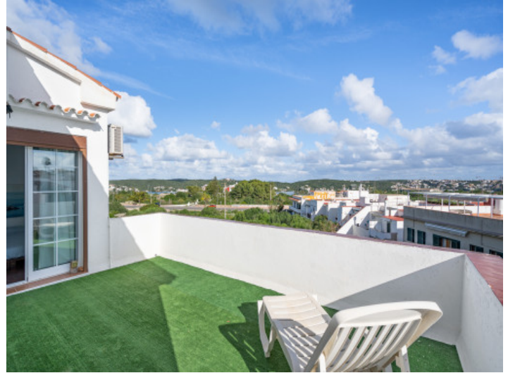
Large upper terrace with a view