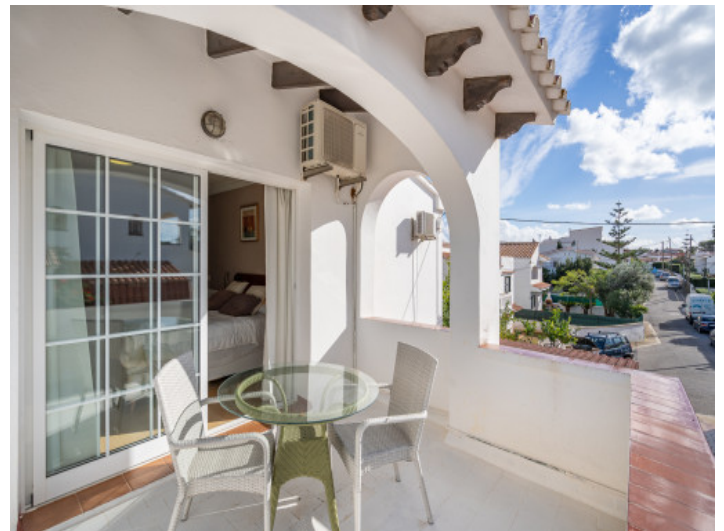
Second terrace on the upper floor