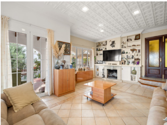
Direct access to the terrace