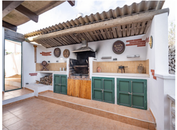
Fantastic bbq area