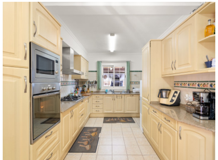
Kitchen with ample space

All information is correct to the best of our knowledge. Errors and prior sale excepted. This prospectus is purely for information purposes. Only the notarized deed of sale is legally binding.