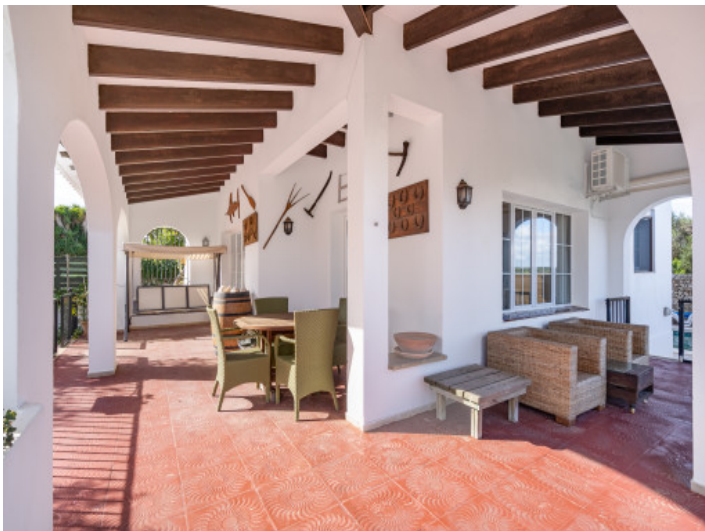
Large covered veranda