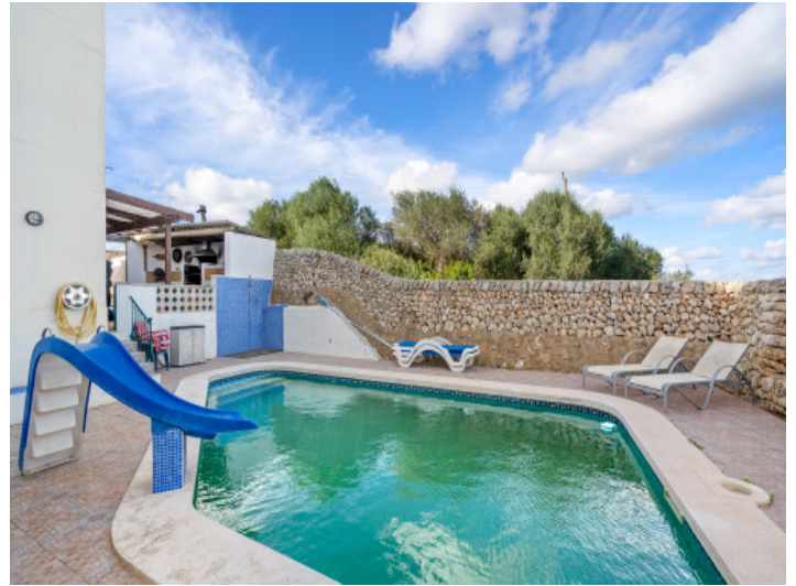
Pool with outdoor shower