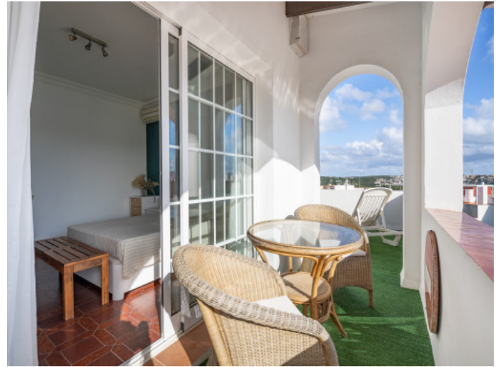
Terrace with seating area