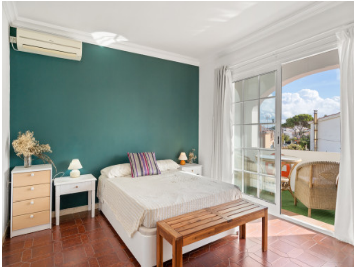
Double bedroom with covered terrace