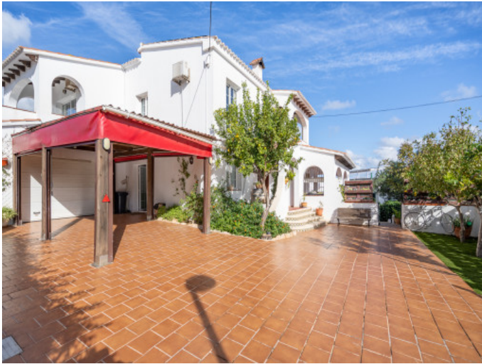
Large front terrace with double garage