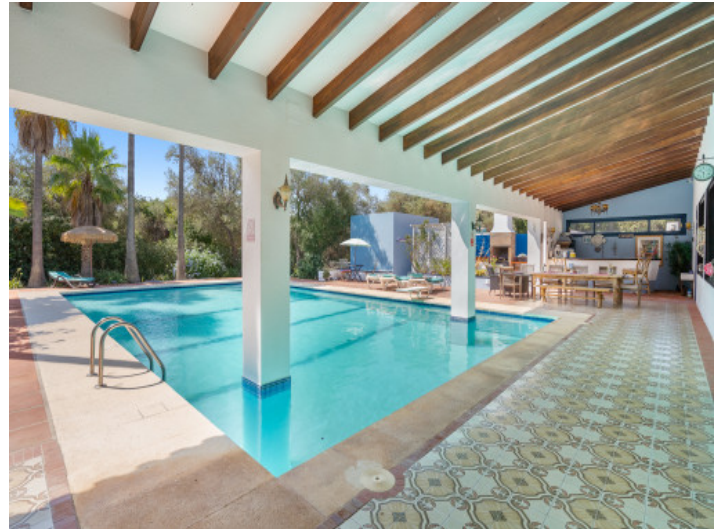
Pool and terrace