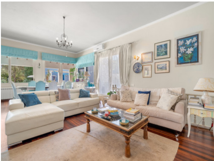
Living area 2