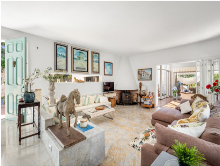
Living area at the entrance