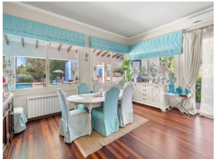
Dining area 2