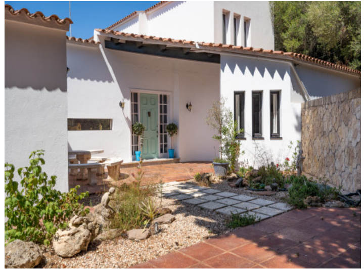
Entrance to the house