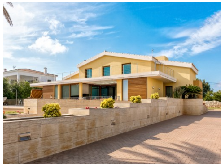
Views of the entrance area