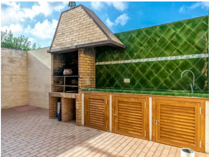
Fantastic outdoor kitchen