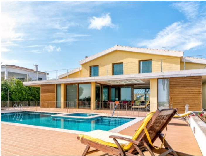
Inviting pool area of the villa