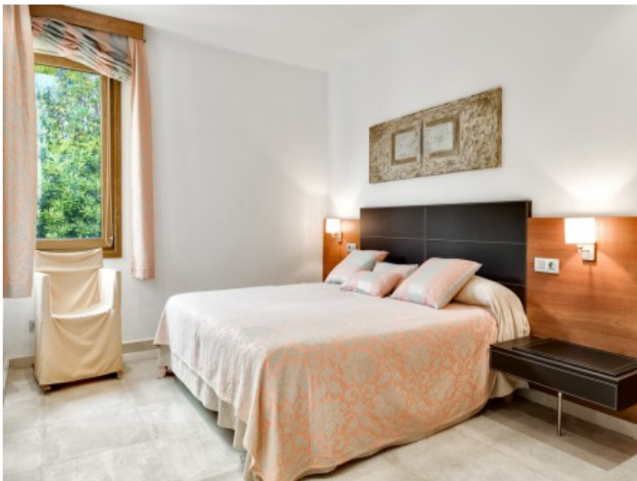
Second master bedroom