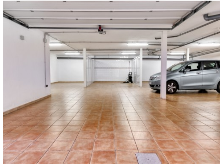
Large garage of the property