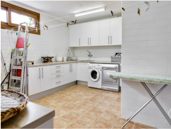
Laundry of the villa