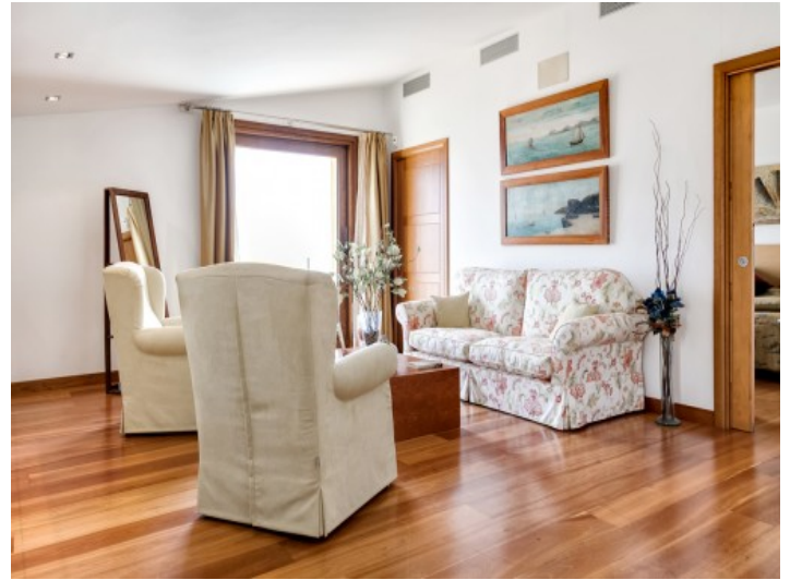
The master bedroom offers a own living area