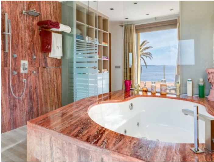
Bathroom en suite of this bedroom