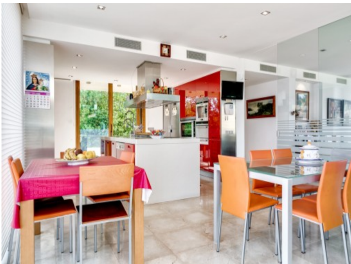
Dining area in the kitchen