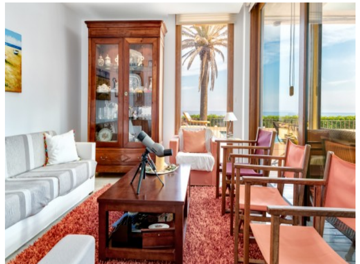
Separate lounge area