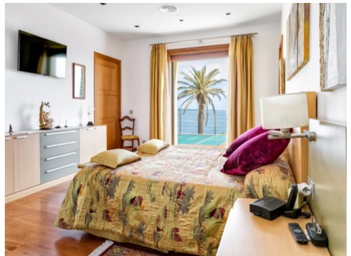
Master bedroom with sea views

All information is correct to the best of our knowledge. Errors and prior sale excepted. This prospectus is purely for information purposes. Only the notarized deed of sale is legally binding.