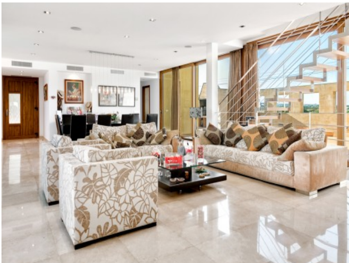
Alternative views of the living area