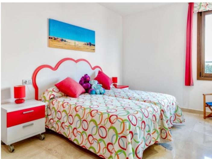
Colourful guest bedroom with bathroom en suite