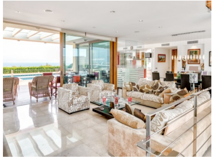
Spacious living area with access to the garden