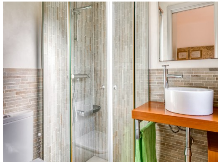
Bathroom of the second bedroom