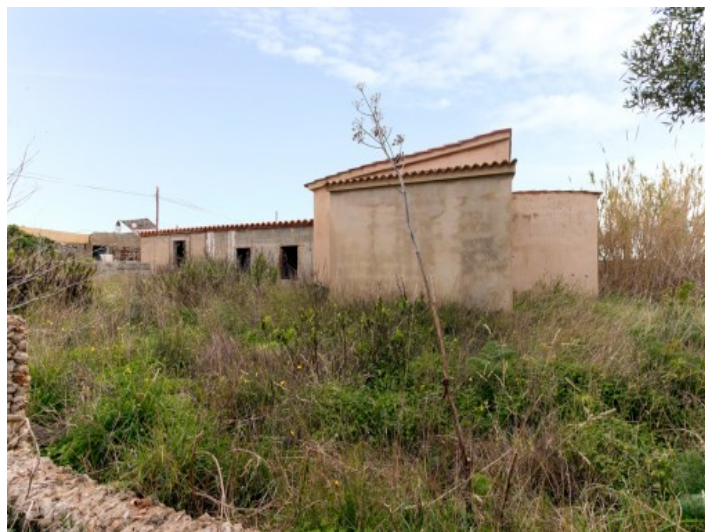
Alternative view of the plot