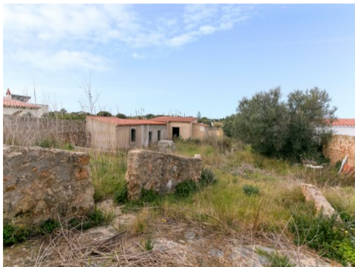
Alternative view of the plot