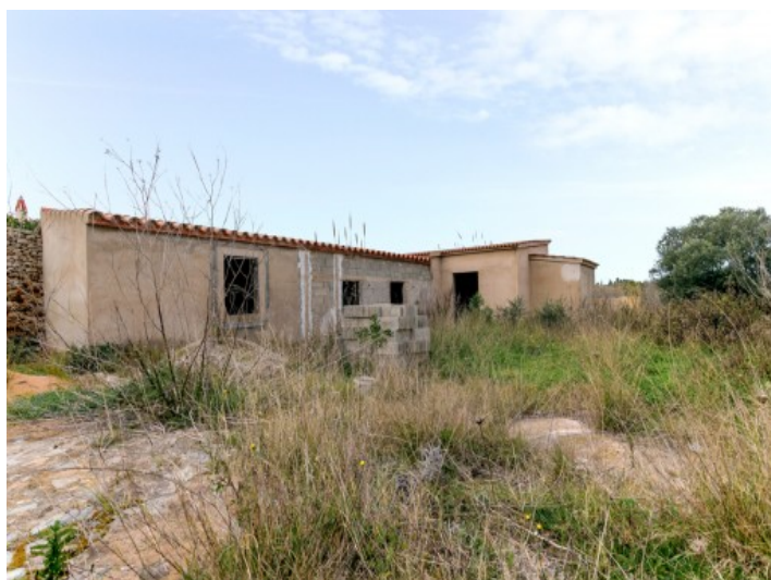
Alternative view of the plot

All information is correct to the best of our knowledge. Errors and prior sale excepted. This prospectus is purely for information purposes. Only the notarized deed of sale is legally binding.