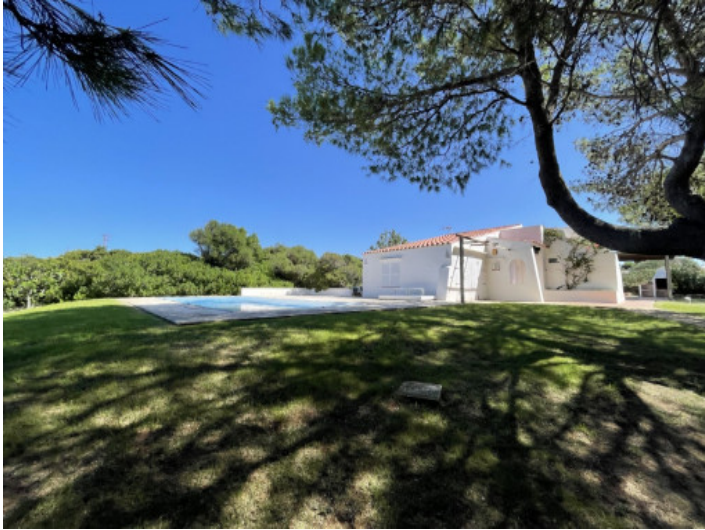
view to the house