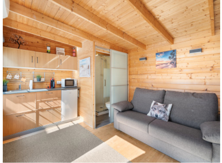
Living area guest house