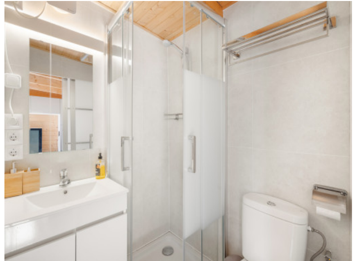
Bathroom guest house