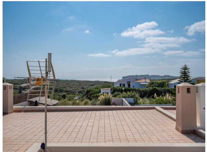
Stuning views up to Cala Llonga

All information is correct to the best of our knowledge. Errors and prior sale excepted. This prospectus is purely for information purposes. Only the notarized deed of sale is legally binding.