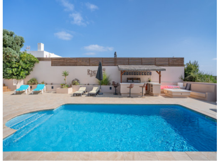
Large pool and BBQ