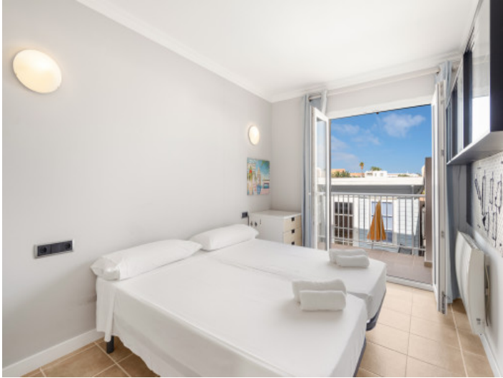
One of 4 bedrooms°