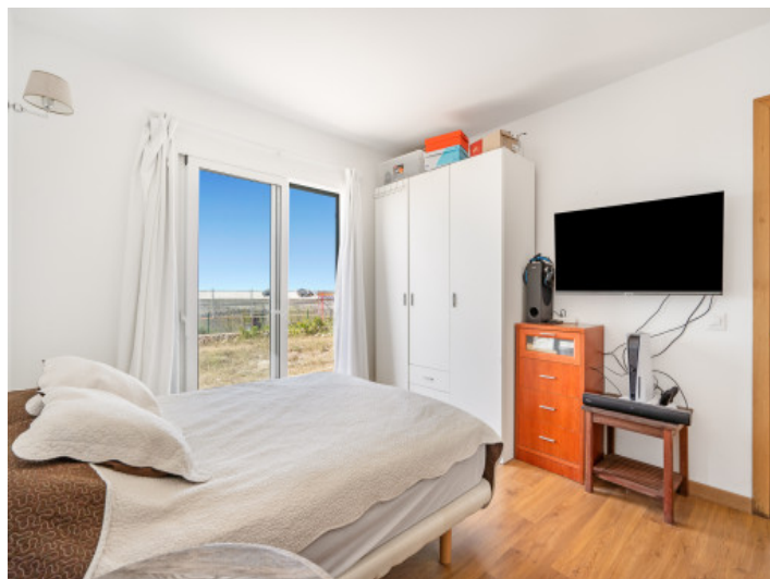
Mastersuite with dressing room