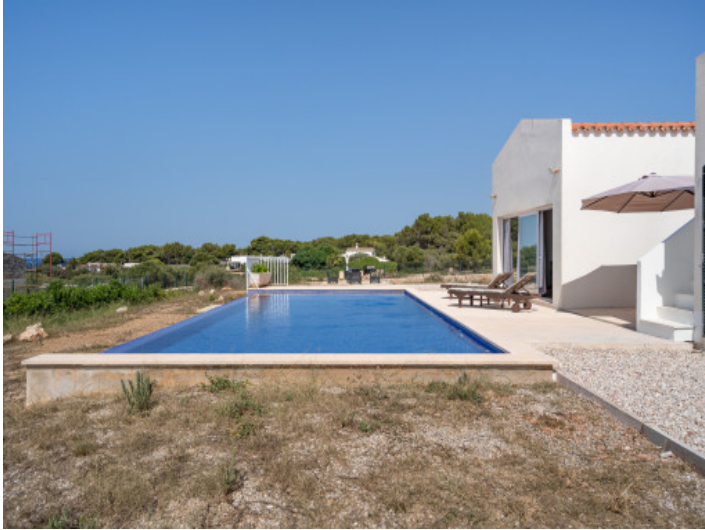
Large garden and pool