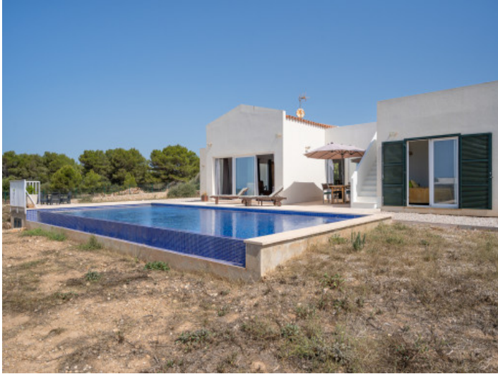
Pool and garden