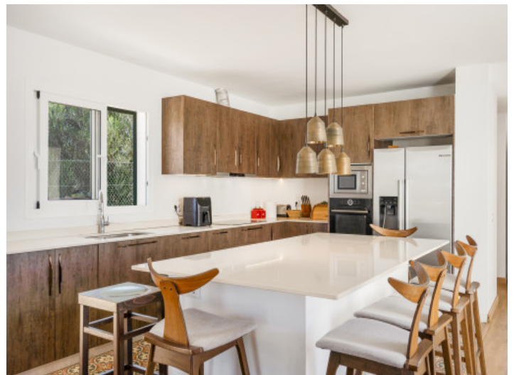
Large kitchen island

All information is correct to the best of our knowledge. Errors and prior sale excepted. This prospectus is purely for information purposes. Only the notarized deed of sale is legally binding.