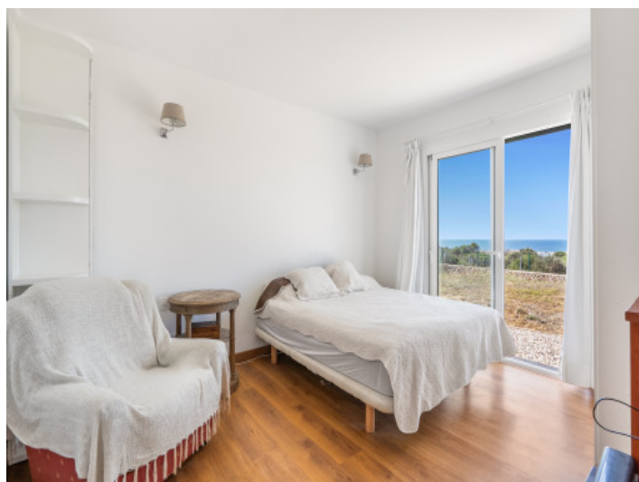
All bedrooms are garden facing