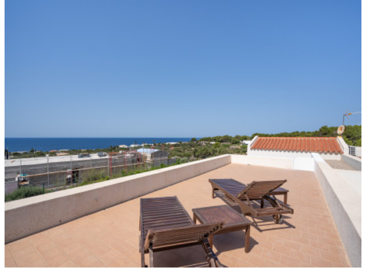
Rooftop terrace with sea view