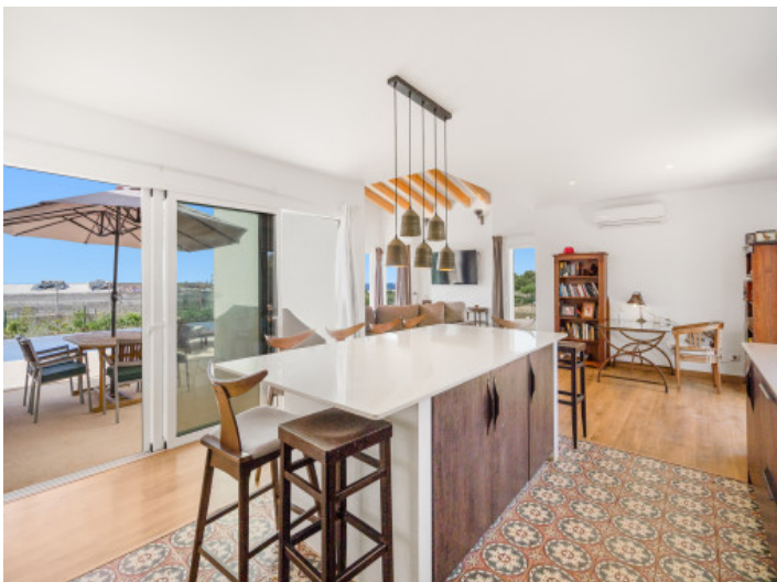
Kitchen with terrace access