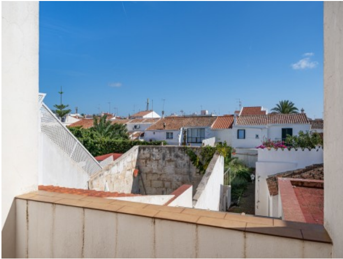
Balcony and view