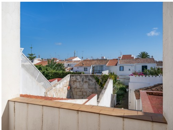
Balcony and view