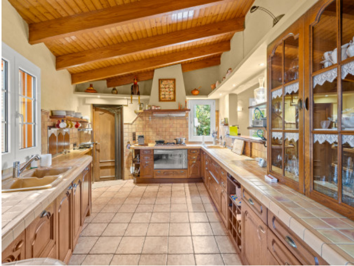
Large country house kitchen