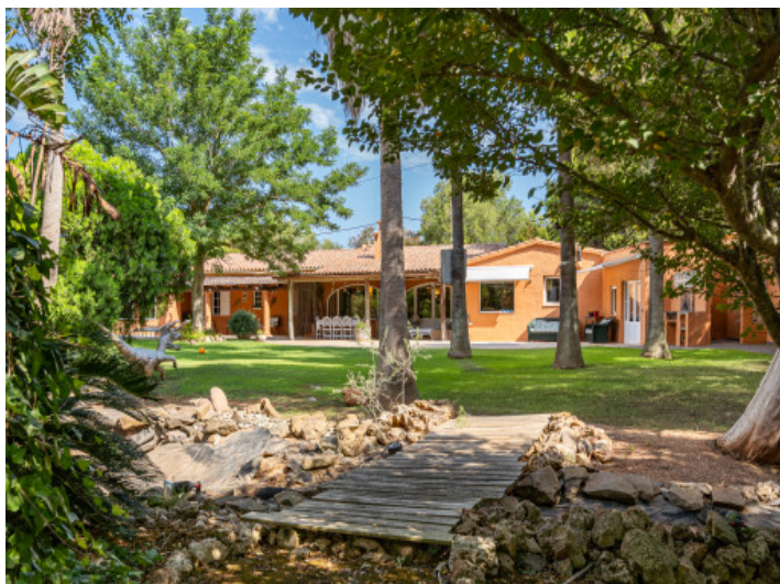
Finca with wonderful garden