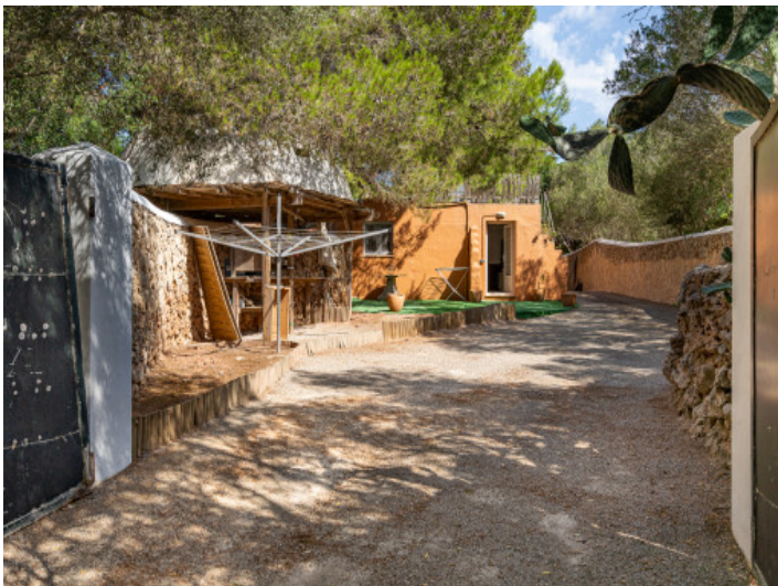
Access to the guest apartment