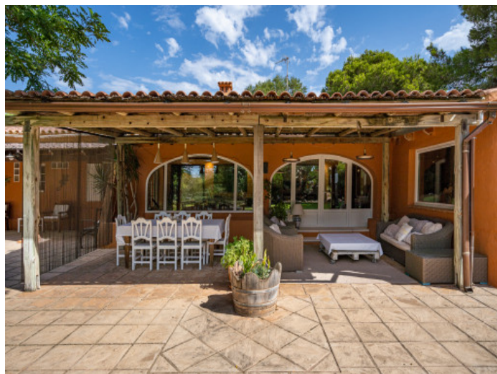
Large outdoor dining area