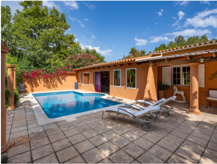
Lovely pool and terarce area