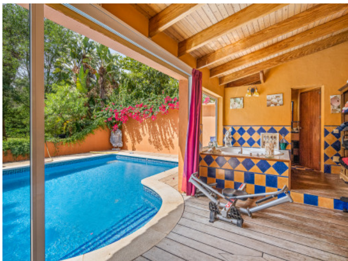
Covered pool terrace with jacuzzi