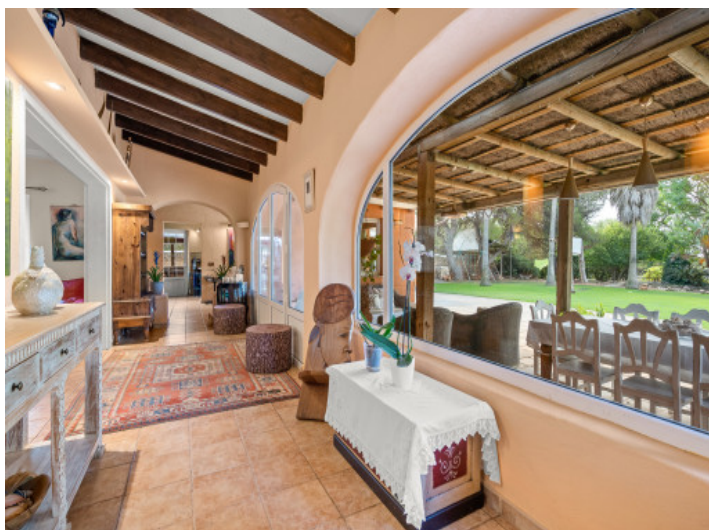
Large window front and terrace access