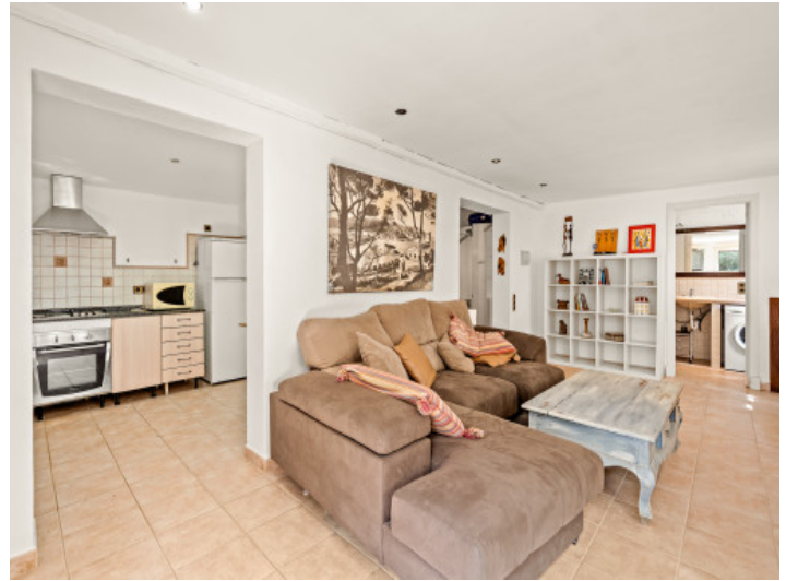
Separate guest apartment