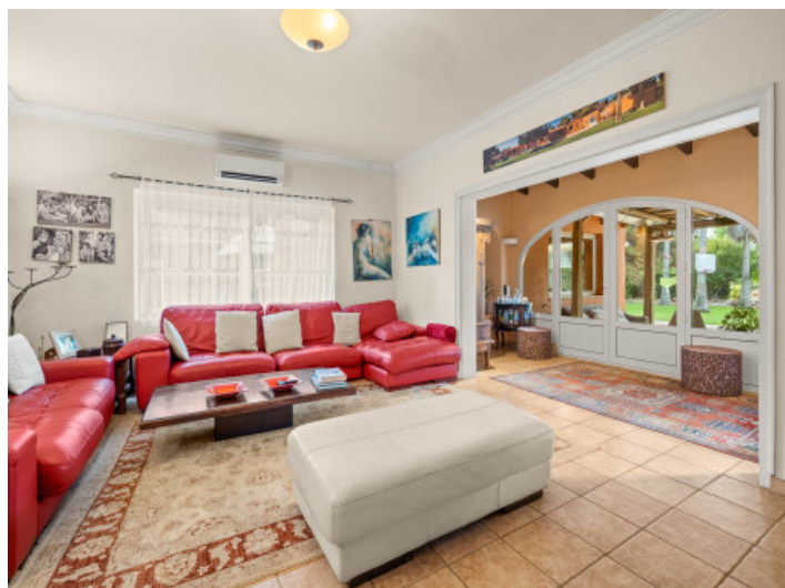
Generous living area

All information is correct to the best of our knowledge. Errors and prior sale excepted. This prospectus is purely for information purposes. Only the notarized deed of sale is legally binding.