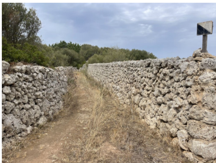
Way to the finca