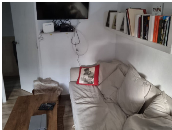
BBQ and outdoor kitchen