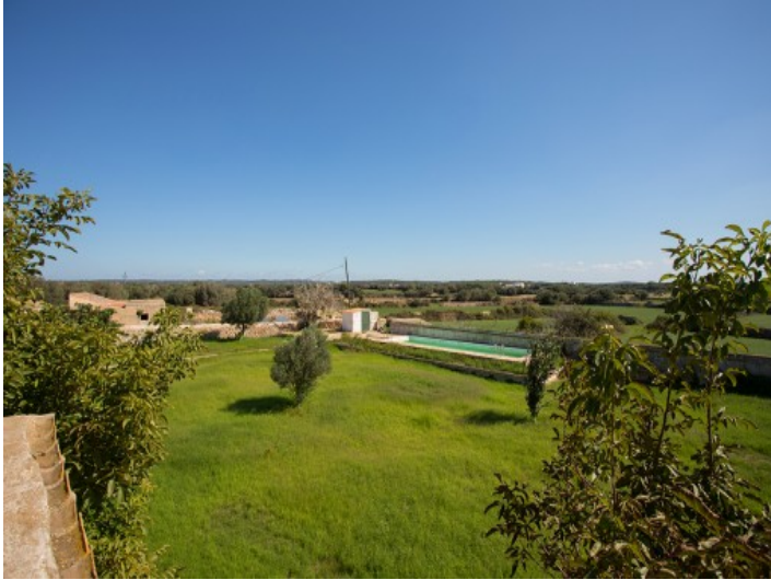
Green garden with pool