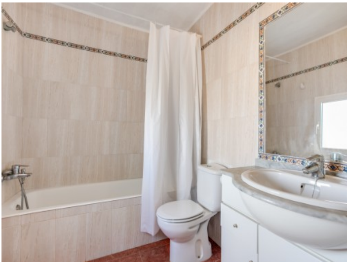
Bathroom with bathtub