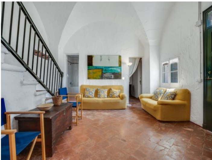
Living area at the entrance