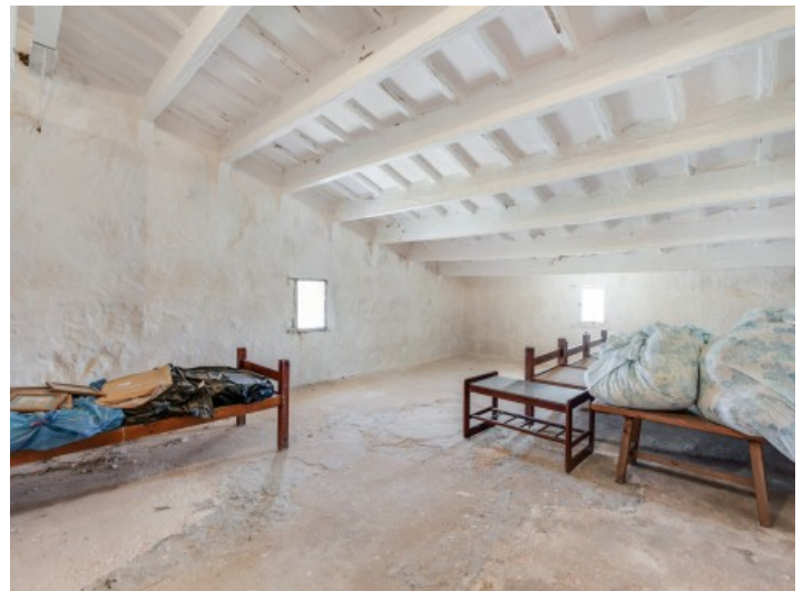
Attic room for renovation