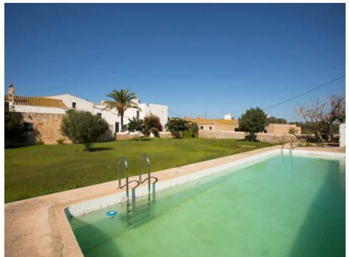
Pool area surrounded by a large garden

All information is correct to the best of our knowledge. Errors and prior sale excepted. This prospectus is purely for information purposes. Only the notarized deed of sale is legally binding.