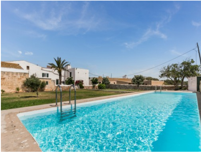
Enchanting pool area