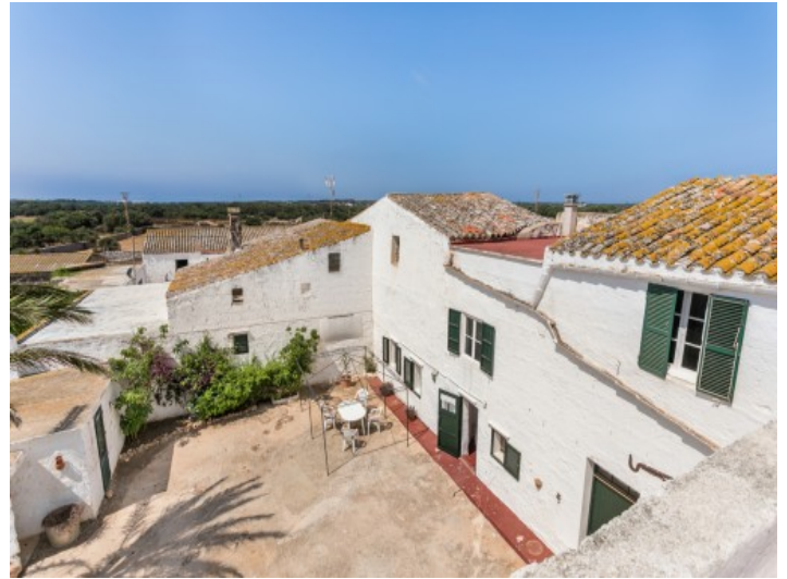
Roof terrace with panoramic views