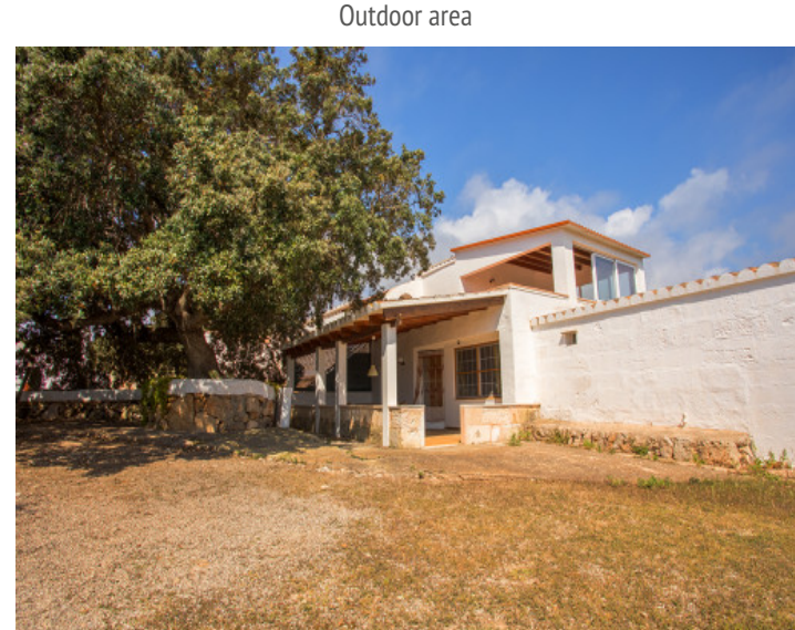
Outdoor area Outdoor area