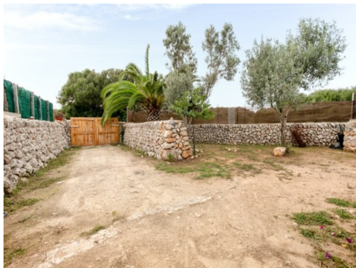
Large garden and entrance area

All information is correct to the best of our knowledge. Errors and prior sale excepted. This prospectus is purely for information purposes. Only the notarized deed of sale is legally binding.