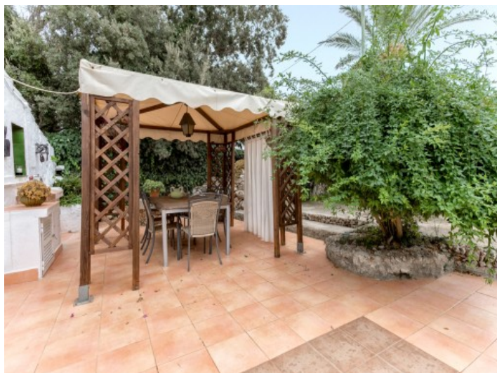
Exterior dining area