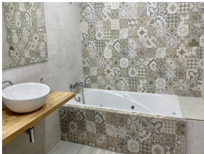
Renovated bathroom with bathub

All information is correct to the best of our knowledge. Errors and prior sale excepted. This prospectus is purely for information purposes. Only the notarized deed of sale is legally binding.