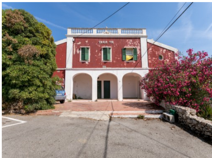
Front view of the villa