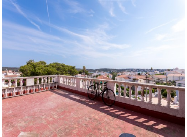
Roof terrace with fantastic views of the harbour