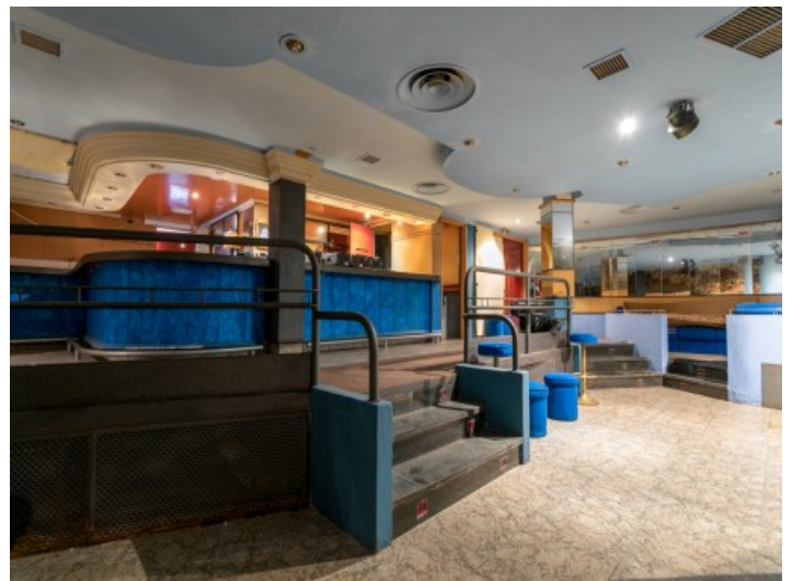
View of the bar area

All information is correct to the best of our knowledge. Errors and prior sale excepted. This prospectus is purely for information purposes. Only the notarized deed of sale is legally binding.