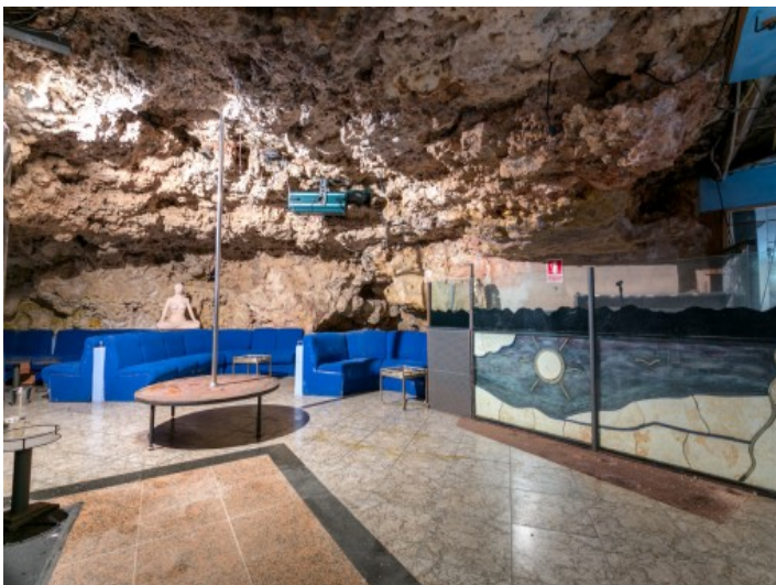
Disco in the cliffs