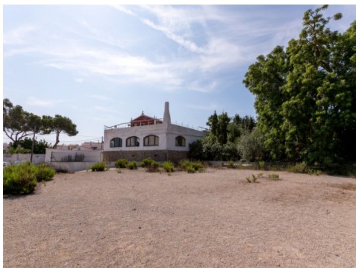
Access to the villa

All information is correct to the best of our knowledge. Errors and prior sale excepted. This prospectus is purely for information purposes. Only the notarized deed of sale is legally binding.