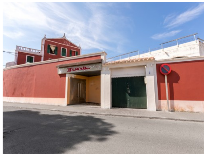
Access to the disco