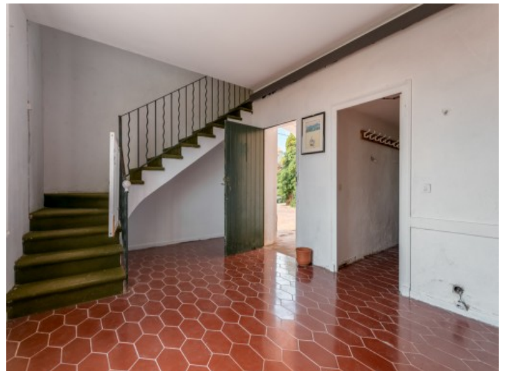
Entrance area with staircase