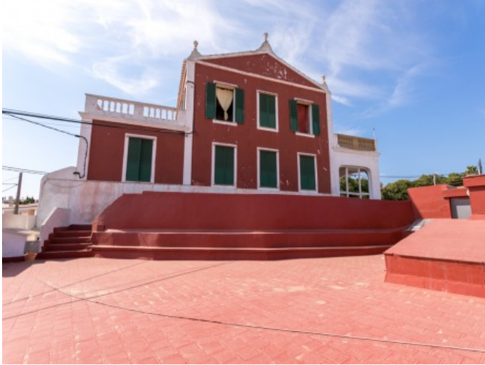
Rear view of the large villa