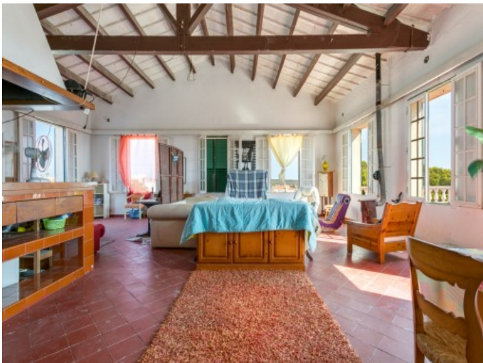
Living area with high ceiling