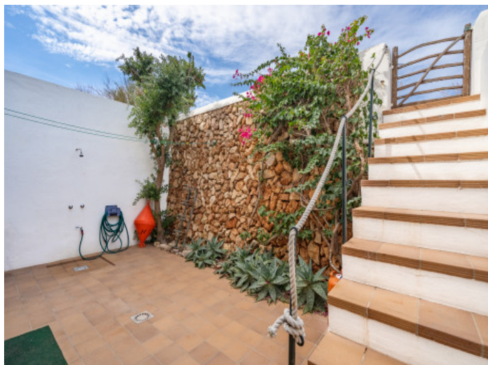
Private terrace on the rear side