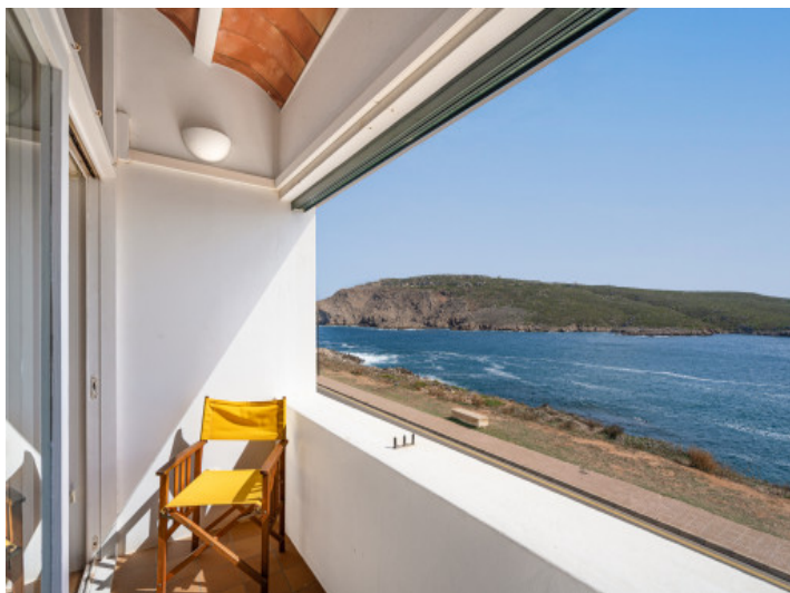
Stunning sea views from the balcony