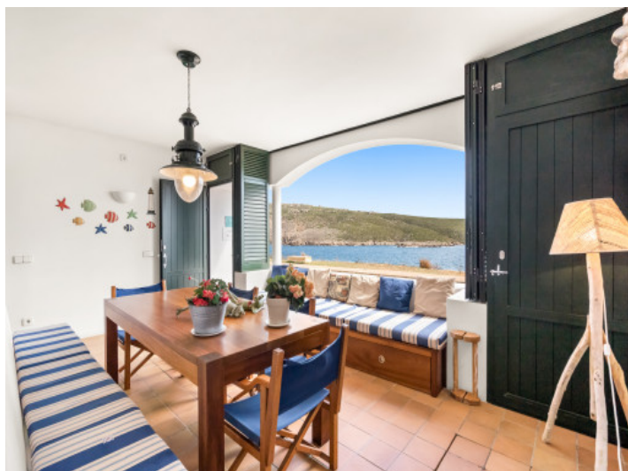
Enchanting indoor-veranda with sea views