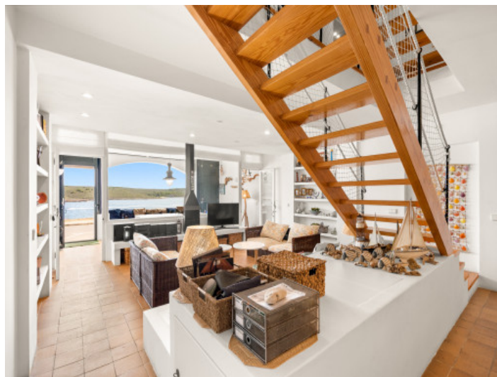
Wonderful sea views from the living area