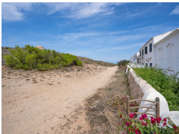
Rear view of the house