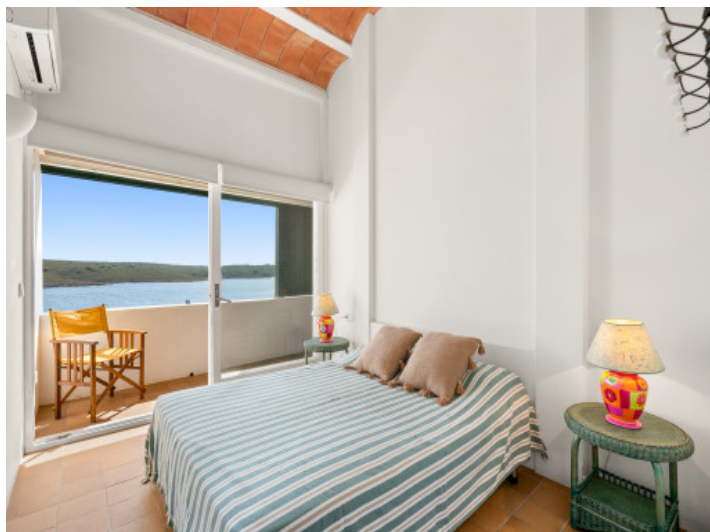
Dreamlike sea view bedroom