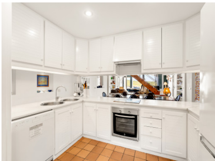
Wonderful kitchen in white