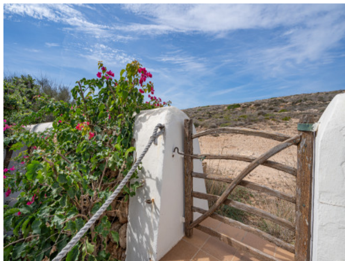
Access to the Cami de Cavalls