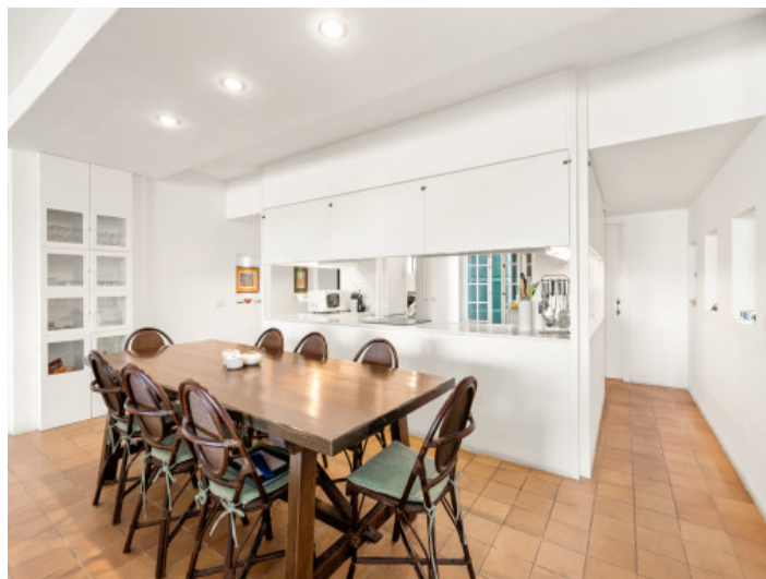
Dining area and half-open kitchen