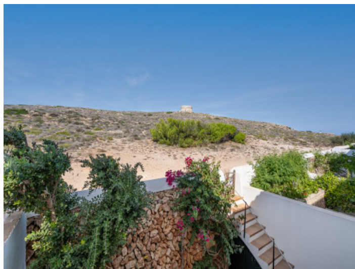
View from the rear side of the house

All information is correct to the best of our knowledge. Errors and prior sale excepted. This prospectus is purely for information purposes. Only the notarized deed of sale is legally binding.