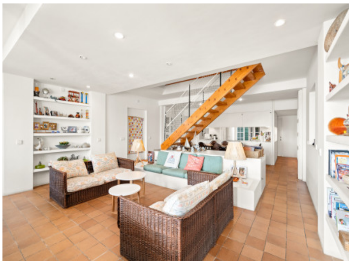
Spacious, open living area