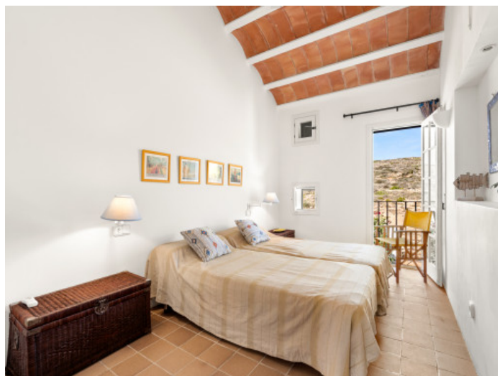
Double bedroom with balcony

All information is correct to the best of our knowledge. Errors and prior sale excepted. This prospectus is purely for information purposes. Only the notarized deed of sale is legally binding.