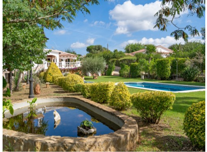
Lovely garden with pond and vegetation